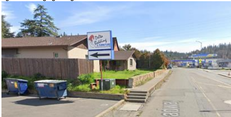
Figure 2. Existing Sign - August 2023

Illegal On-Premise Signs are defined as follows: